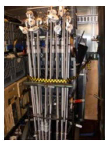
Interior is based on a hybrid cart/shelving system - 5 carts roll out or left left in the truck and become shelves