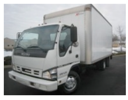
3 ton is 2006 GMC with a 16 foot box and a 8 foot wide by 6 foot long lift gate